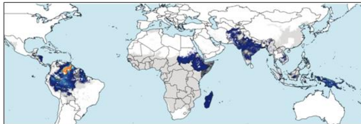
P. vivax geographical distribution

Malaria is a disease caused by a parasite infection called Plasmodium which is transmitted by mosquitoes. Plasmodium vivax is the most widespread of all the Plasmodium species known to cause malaria in humans with approximately 3.3 billion people living in areas at risk of infection. P. vivax causes significant health problems in many areas of the world. Between 2018-2022, more than 5 million P. vivax infections occurred every year.