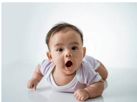
Decorative image: a baby laying on the floor, in crawling position

Full title: Evaluation of higher valency pneumococcal vaccines (PCV15/ PCV20) compared to PCV13 given in homologous schedules at 3/4 months and 12 months (“1+1” schedule) and 2 months, 4 months and 12 months (“2+1” schedule) in infants.