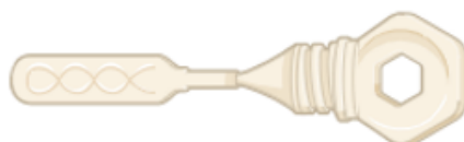
Figure 1: a nasal fluid sampling swab - this is a paper like sampling swab that has a smaller end to take the sample, and a larger end to hold the swab.

We will also collect samples of nasal secretions at 3 of the study visits if receiving two doses of either PCV 15, PCV 20, or PCV 13. We will collect samples of nasal secretions at 4 of the study visits if receiving three doses of PCV20. This will be done using a paper nose swab, which looks like soft paper. This will be inserted up the nostril and then the outside of the nose is pressed gently closed with a finger, so it touches the passage of the nostril for 60 seconds. The procedure may tickle a bit but is painless. These swabs will give us information about how the immune system in the nose changes after vaccination.